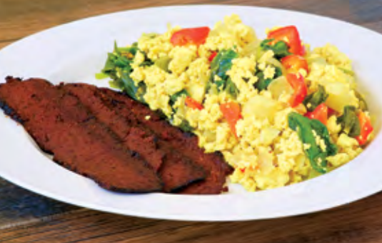
Tofu Scramble & Vegan Bacon • 25 G Protein